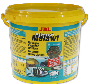
JBL NovoMalawi Main food flakes for algae-eating cichlids