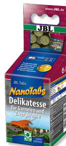
JBL NanoTabs Main food for shrimp and dwarf crayfish