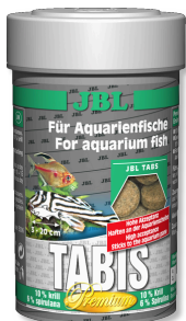
JBL Tabis Premium food tablets for freshwater and marine fish