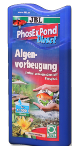
JBL PhosEX Pond Direct Phosphate remover for ponds