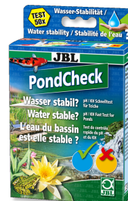
JBL PondCheck Quick test to determine the pH and KH values