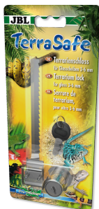
JBL TerraSafe Lock for terrarium pane