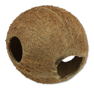
JBL Cocos Cava Coconut cave for aquariums and terrariums