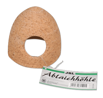
JBL Ceramic spawning cave Ceramic cave for freshwater aquariums