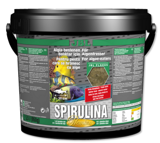
JBL Spirulina Premium main food for algaeeating aquarium fish