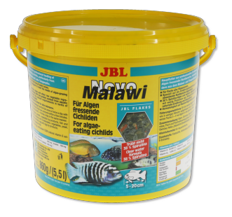
JBL NovoMalawi Main food flakes for algaeeating cichlids