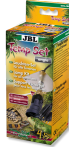
JBL TempSet angle Installation kit for lamps in terrariums