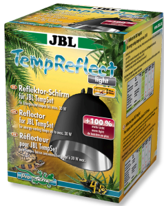
JBL TempReflect light Reflector screen for energy- saving lamps