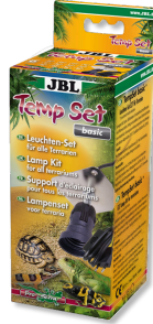
JBL TempSet basic Installation kit for lamps in terrariums