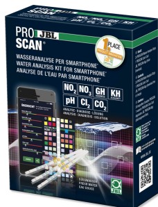
JBL PROSCAN Water test with analysis via smartphone