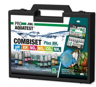
JBL PROAQUATEST COMBISET Plus NH4 Test case with most important water tests + NH4 test