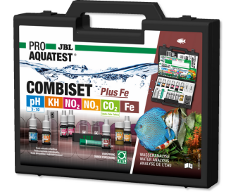
JBL PROAQUATEST COMBISET Plus Fe Test case with most important water tests + iron test