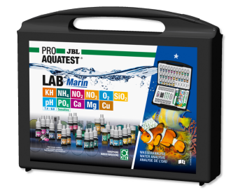
JBL PROAQUATEST LAB Marin Professional test case for marine water analysis