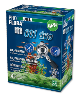
JBL PROFLORA m001 duo

Fitting to reduce pressure for 2 CO2 diffusers