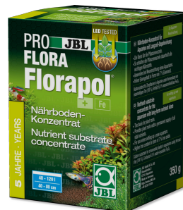
JBL PROFLORA Florapol Long-term nutrient substrate concentrate