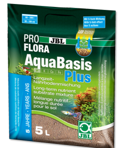
JBL PROFLORA AquaBasis plus Long-lasting nutrient substrate f. freshwater aquarium