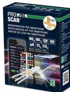
JBL PROSCAN Water test with analysis via smartphone