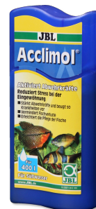
JBL Acclimol Water conditioner for acclimatisation