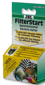
JBL FilterStart Bacteria for the activation of filters