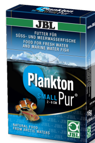
JBL Plankton Pur SMALL Treats for small aquarium fish