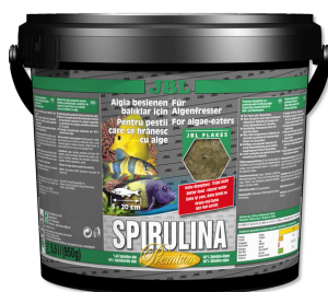
JBL Spirulina Premium main food for algae-eating aquarium fish