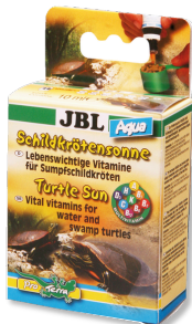
JBL Turtle Sun Aqua Vitamins for turtles and pond terrapins