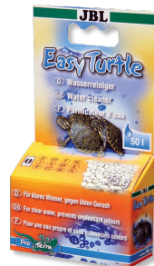
JBL EasyTurtle Special granulate to remove odours