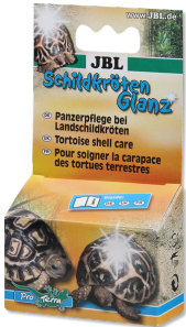
JBL Tortoise shell care Shell care for tortoises