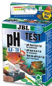
JBL pH Test 6.0-7.6 pH test for freshwater aquariums in the range 6.0-7.6