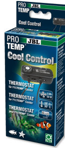
JBL PROTEMP CoolControl