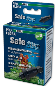
JBL PROFLORA SafeStop Water backflow stop for CO2 systems