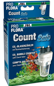
JBL PROFLORA CO2 Count Safe Bubble counter with backflow stop