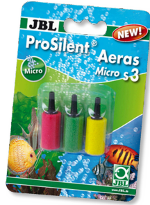
JBL ProSilent Aeras Micro S3 Air stone set for fine air bubbles in aquariums