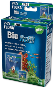
JBL PROFLORA BioRefill Refill set for bio-CO2 systems