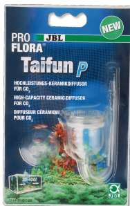
JBL PROFLORA Taifun P Mini CO2 diffuser for nano freshwater aquariums