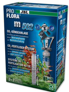
JBL PROFLORA m502 CO2 plant fertiliser system with night switch-off