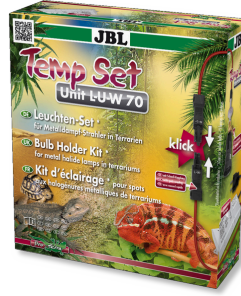
JBL TempSet Unit L-U-W Installation kit for metal-halide lamps