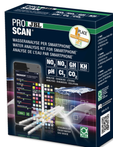
JBL PROSCAN Water test with analysis via smartphone