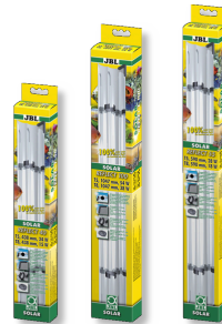
JBL SOLAR Reflect T5/ T8 - 895-1500 mm Reflector panel for fluorescent tube