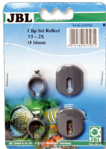
JBL SOLAR REFLECT Clip Set Holder for fluorescent tubes