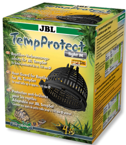
JBL TempProtect light Reptile thermal burn protection for JBL TempSets