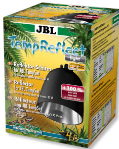
JBL TempReflect light Reflector screen for energy-saving lamps