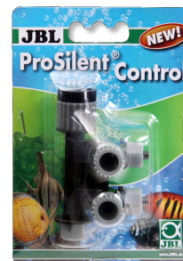
JBL ProSilent Control