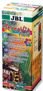
JBL TerraVit fluid Vitamins and trace elements for terrarium animals