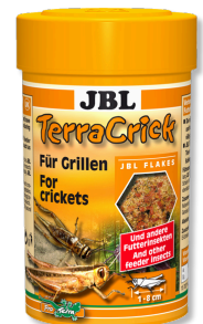
JBL TerraCrick Complete food for feeder insects