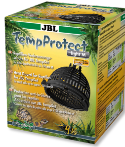
JBL TempProtect light Reptile thermal burn protection for JBL TempSets