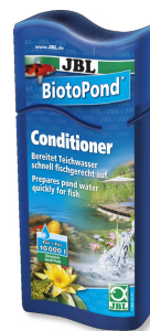
JBL BiotoPond Water conditioner for ponds