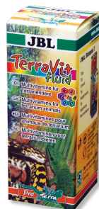
JBL TerraVit fluid Vitamins and trace elements for terrarium animals