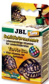
JBL Tortoise Sun Terra Vitamins for tortoises