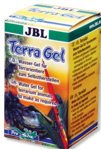
JBL TerraGel Water gel for terrarium animals