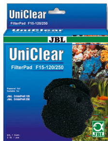
JBL FilterPad F15 Coarse foam pad for aquarium filter CristalProfi