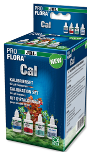
JBL PROFLORA Cal Complete kit for calibration