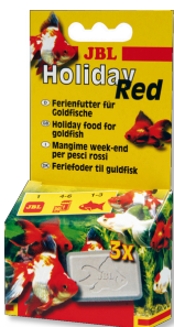
JBL Holiday Red Complete holiday food for goldfish