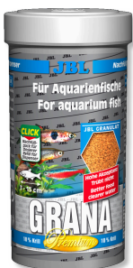
JBL Grana Premium main food granulate for small aquarium fish