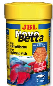
JBL NovoBetta Complete food for labyrinth fish, e.g. fighting fish