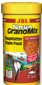
JBL NovoGranoMix Main food for medium-sized and large aquarium fish