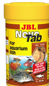
JBL NovoTab Main food tablets for all aquarium fish