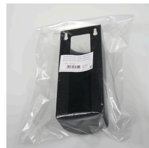
JBL PF CO 2 BIO THERMAL CASING