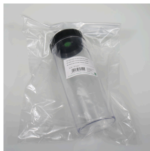
JBL PF CO 2 BIO REAKTOR