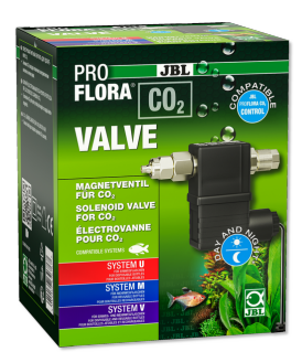
JBL PROFLORA CO2 VALVE

Disposable storage bottle ready-filled with 1.2 kg CO2