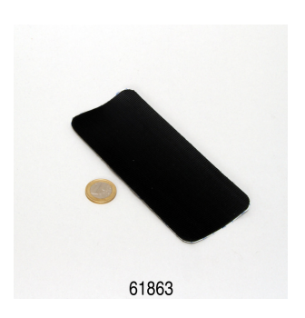
JBL Floaty Pad